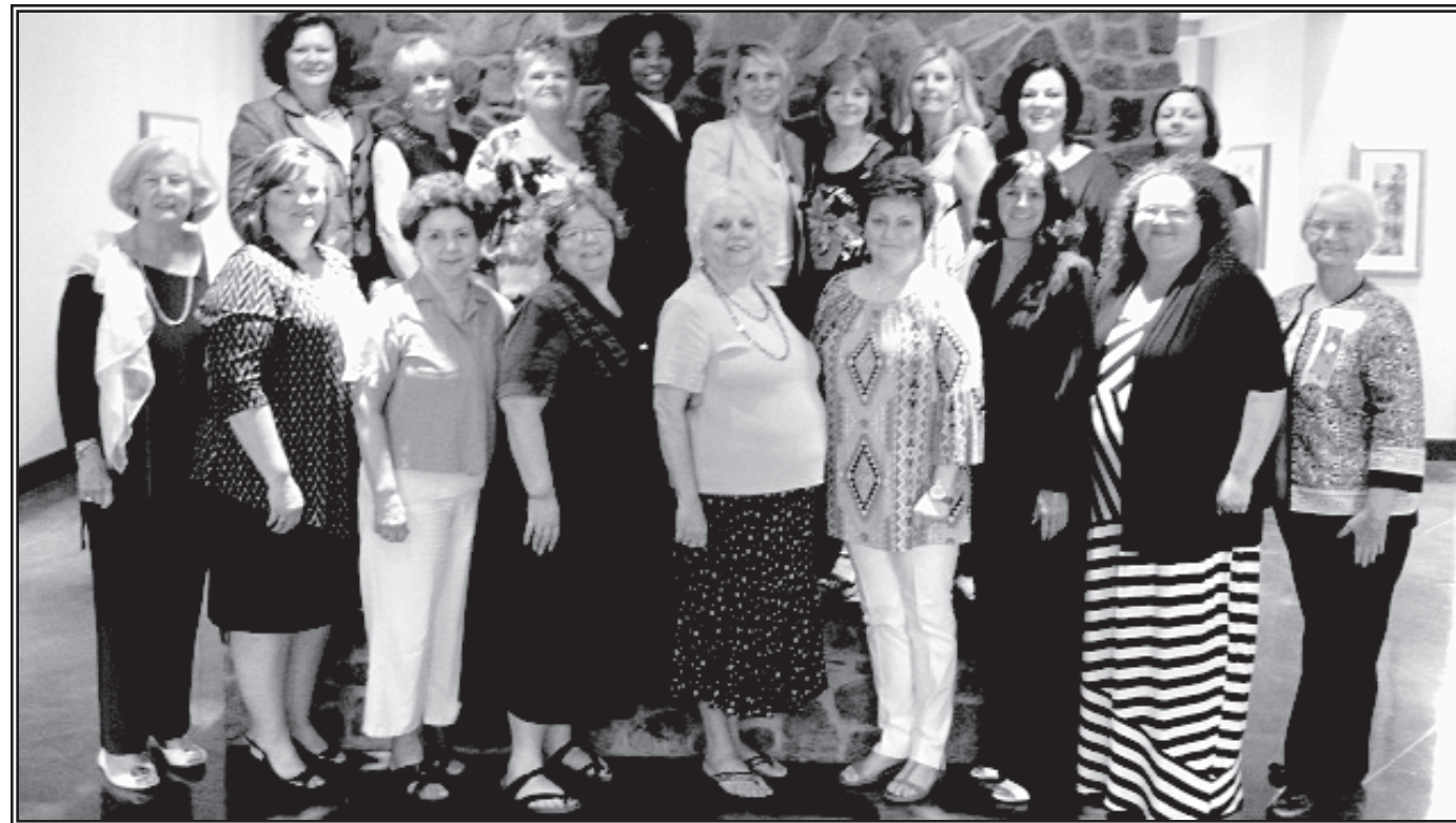
2015 LEADERSHIP MANAGEMENT SEMINAR LEADERS

The application packets are available July 1 and are due February 1 , for both Zeta State and DKG International Scholarships.