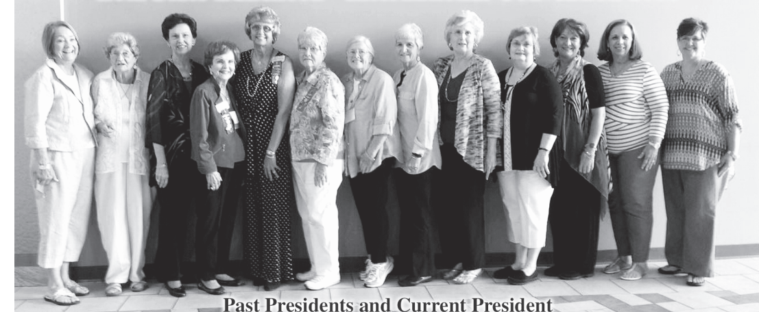
Past Presidents and Current President