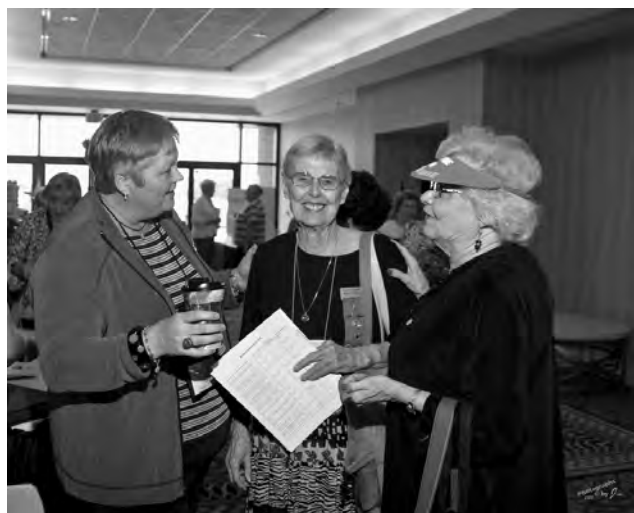
Members chatting during Info Fair