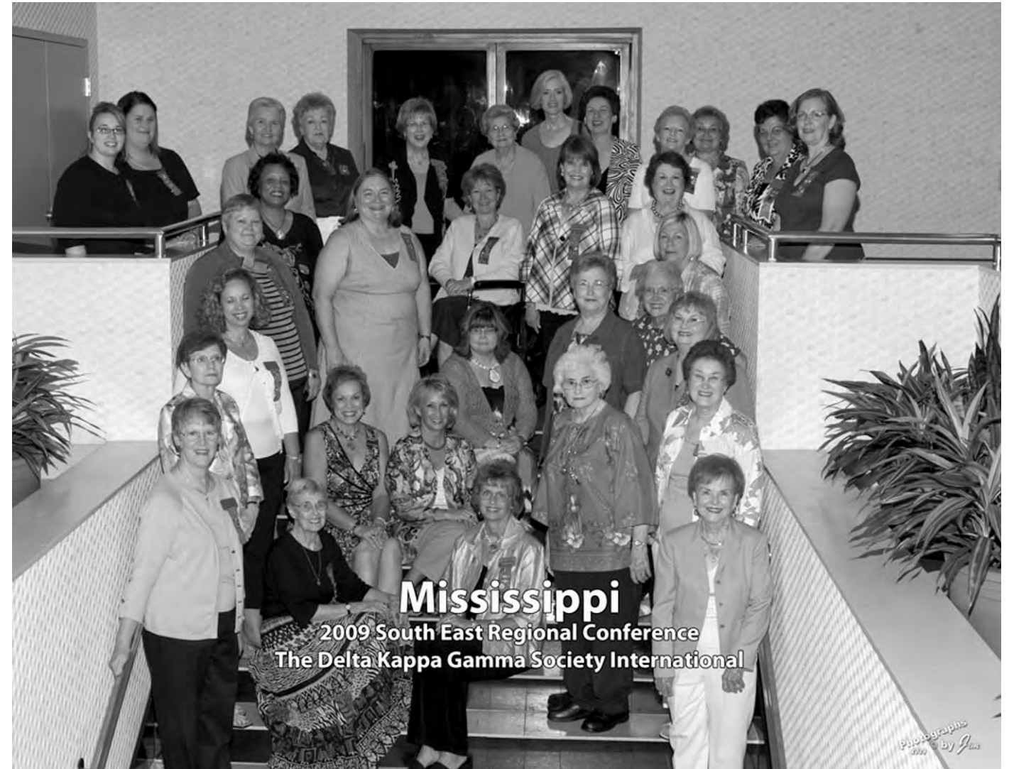
Mississippi 2009 South East Regional Conference The Delta Kappa Gamma Society International