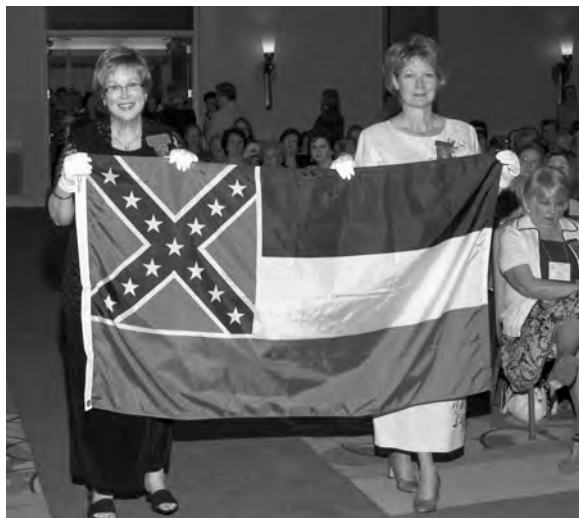
Presentation of the State Flag, pre-foot injury