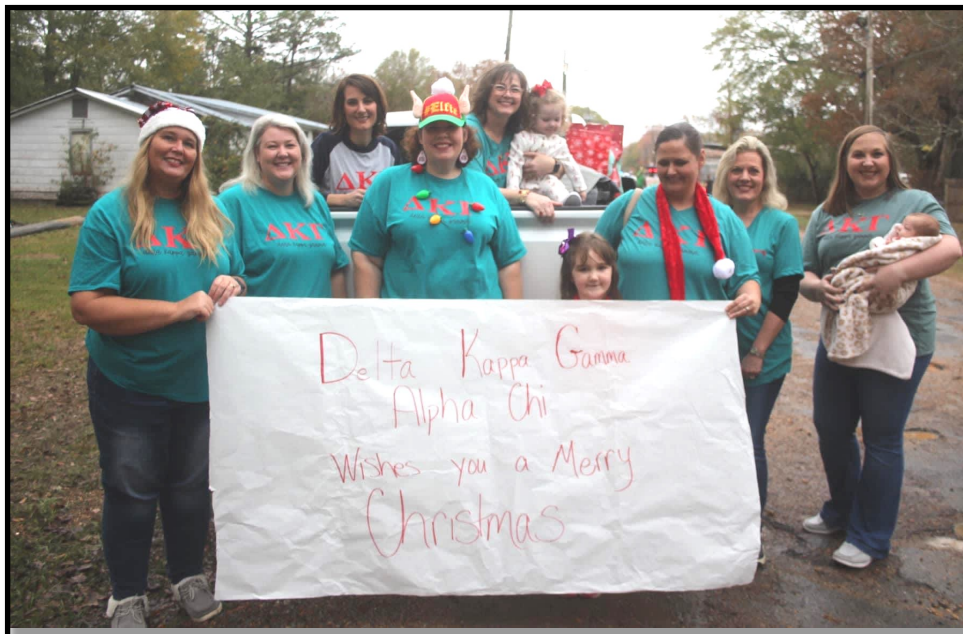
Alpha Chi Chapter had a great time in the D’Lo Christmas Parade! This was a first, but not the last!